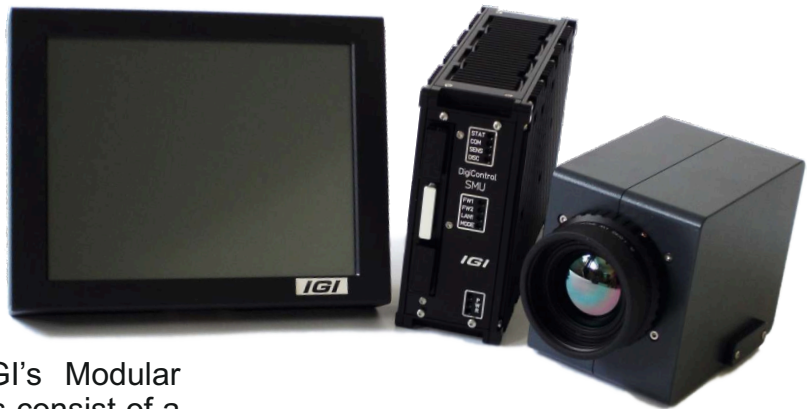
8 inch TFT touch-screen, DigiControl SMU with hot swap storage unit and thermal camera

DigiTHERM is one part of IGI's Modular Sensor Systems. Its components consist of a thermal camera, a DigiControl SMU with hot swap storage unit for up to 36 hours of flying time and an 8 inch TFT touch-screen. Using the same components as DigiCAM the changeover between the two systems is realised within minutes.